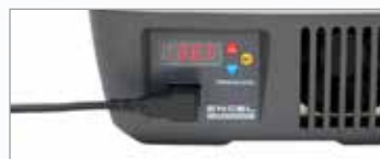
Digital Temperature Controller